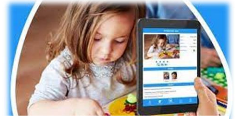
We use the 'Evidence Me' App to share and receive snippets of learning and those all-important 'WOW' moments!

The most important person in your child's life is you! Parents have a fundamental role to play in their child's education and together, as partners, we can make their St Joseph & St Theresa's experience a huge success. We pride ourselves on our parental partnerships and involve you fully in your child's learning and development. We aim to achieve this by:-