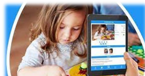
We use the 'Evidence Me' App to share and receive snippets of learning and those all-important 'WOW' moments!

The most important person in your child's life is you! Parents have a fundamental role to play in their child's education and together, as partners, we can make their St Joseph & St Theresa's journey a huge success. We pride ourselves on our parental partnerships and involve you fully in your child's learning and development.